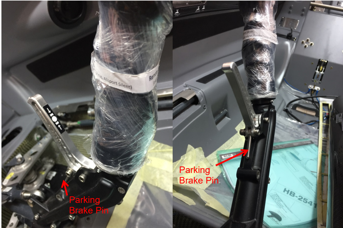
Figure 2: Parking brake pin on the wheel brake lever